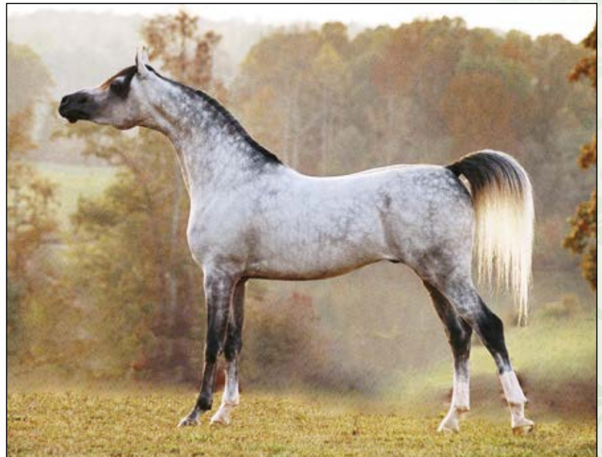
Dakar el Jamaal- US National Champion x Sonoma Lady (US. Res, National Champion)