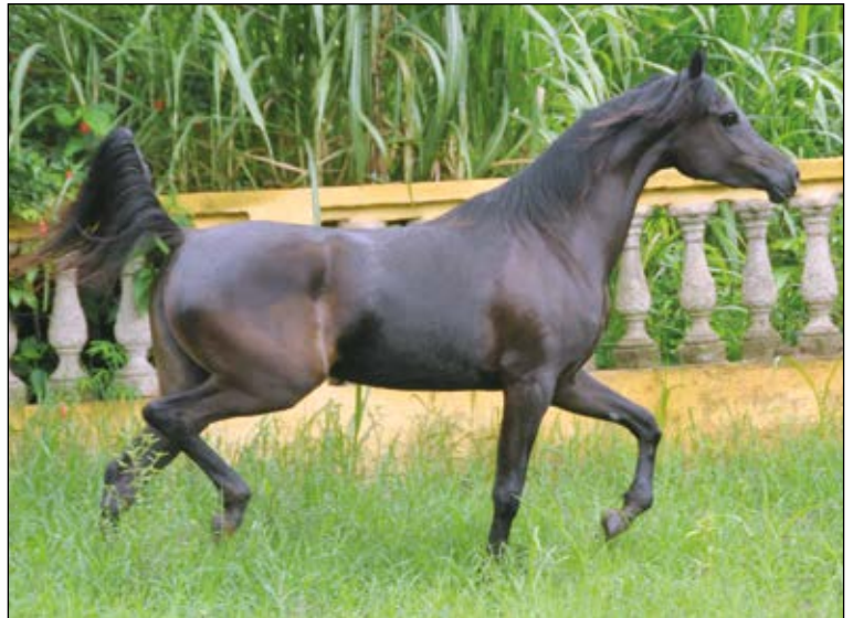
Electra el Perseus, daughter of Ermyne, (3 times Jamaal)