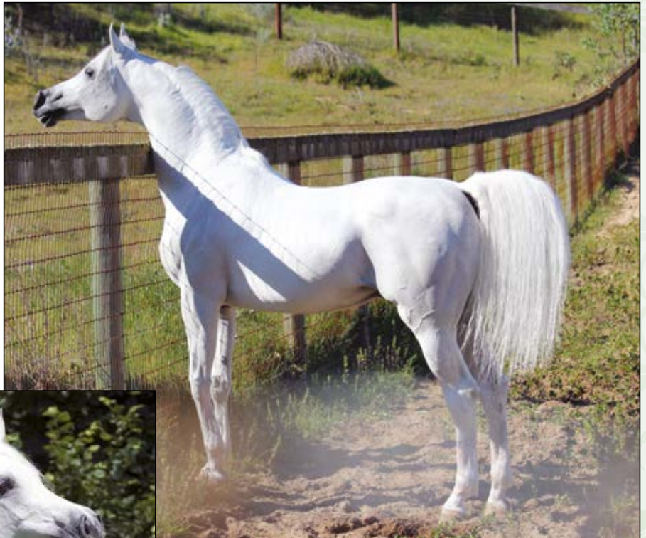
Dakar el Jamaal