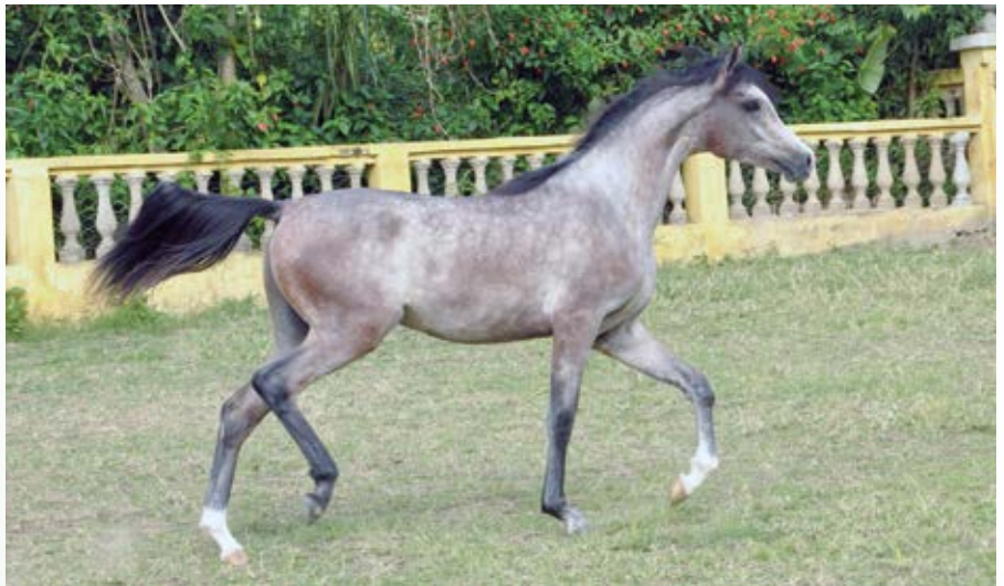
Jaya Enzo x Jullye, Haras Meia Lua