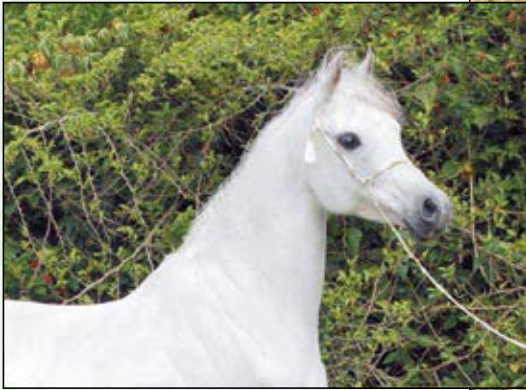
Jylda el Jamaal x Jullye, Haras Meia Lua