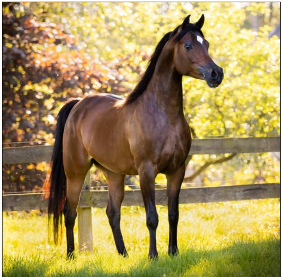
ASE Gabriella al Gazal Gazal al Shaqab x Geraldine el Jamaal, 2018 Bay filly