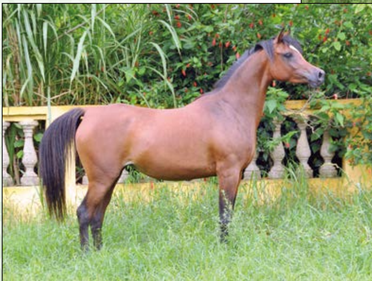
Eryne el Perseus, daughter of Ermyne, (3 times Jamaal)