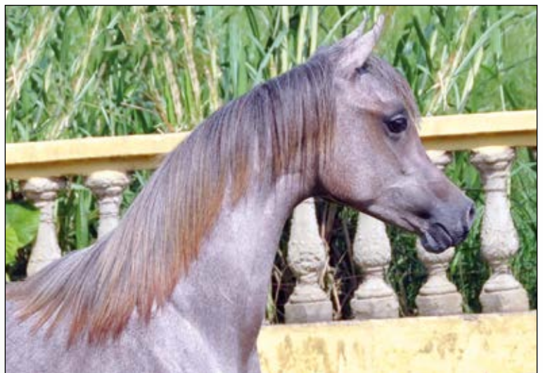
Gdynia el Perseus, owned by Santa Ventura