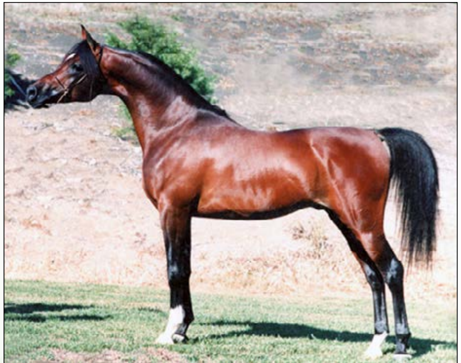
Ali Jamaal after he was acquired, as a 4 years old