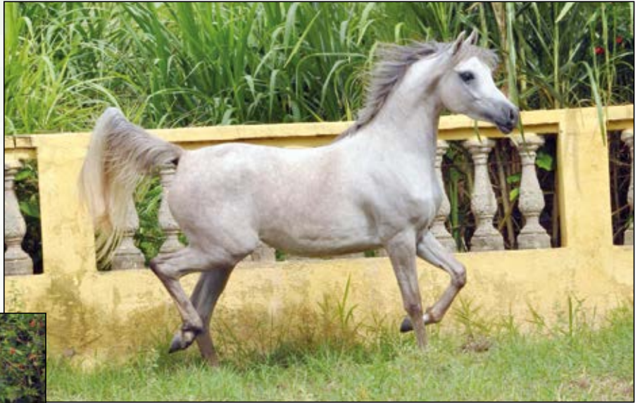
Ghydara el Perseus