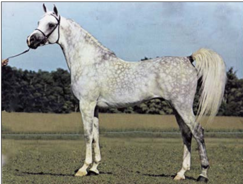
Sbaikh al Badi