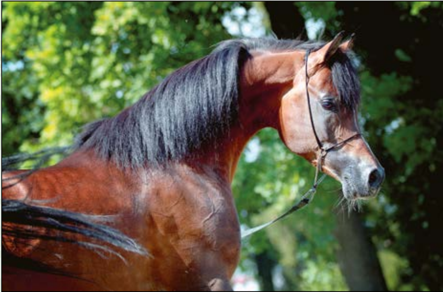
Javier el Jamaal by Juliet (now Dubai Arabian Horse Stud) son of Juliet