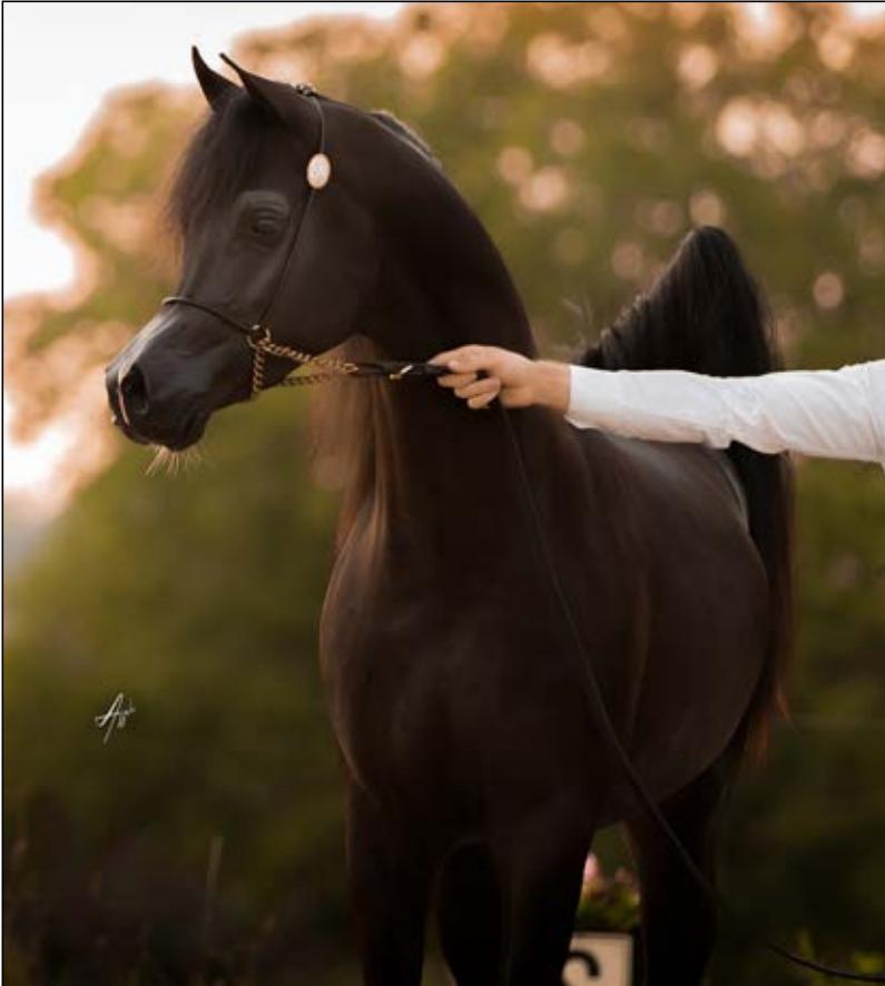
ASE Justice el Jamaal WH Justice x Geraldnye el Jamaal