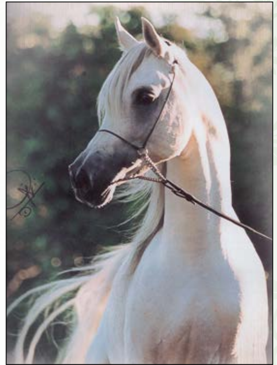
Ryad el Jamaal