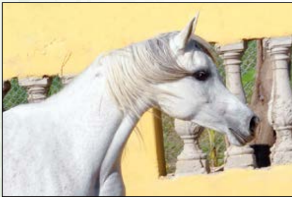
Nogara El Ludjin x Res. National Champion Narab el Jamaal Important matriarch at Haras Meia Lua