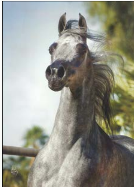
Saudi el Perseus, now in Australia, x Silk el Jamaal